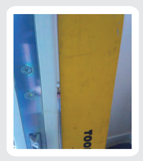
Straight edge on concave face