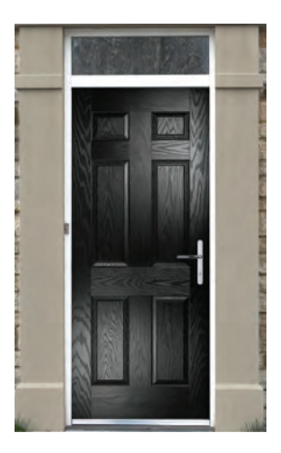
Full external face

After door installation, always check if the frame is level, plumb and square. Issues caused by poor installation will not be covered by warranty. Three images like below must be submitted along with every reported issue of the door slab.